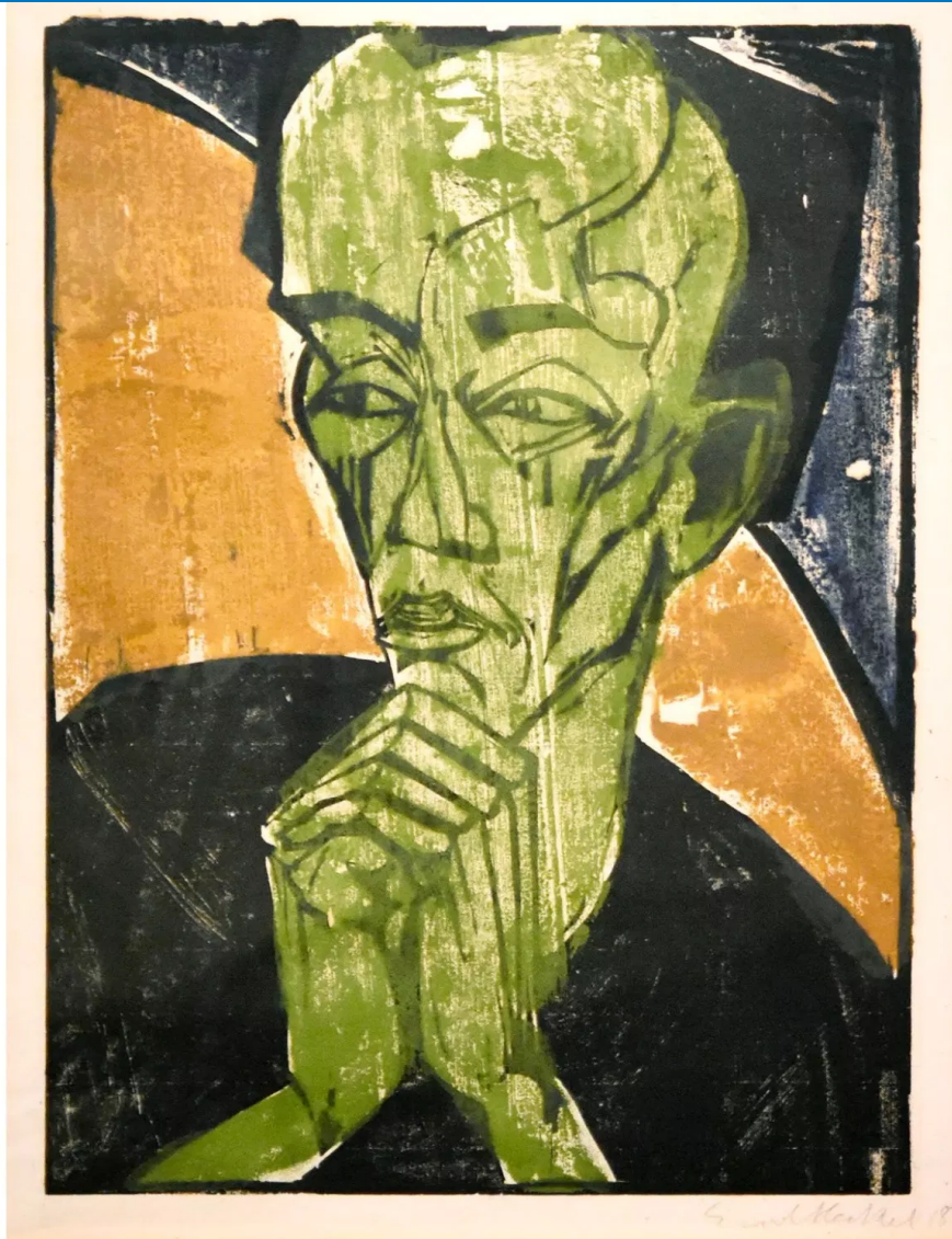
Männerbildnis (Selbstbildnis), 1918, by Erich Heckel. Color woodcut.