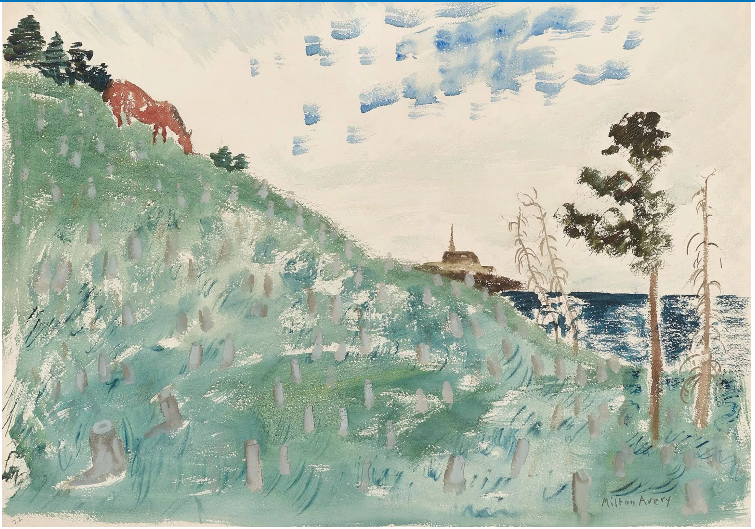
Grazer by the Sea , 1938, by Milton Avery