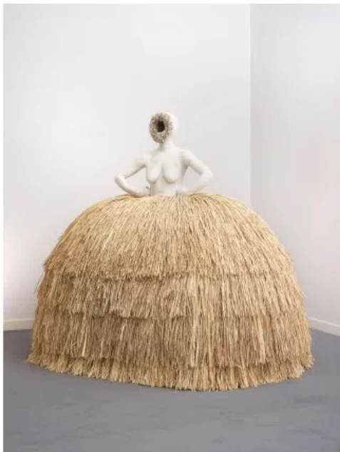
Las Meninas , 2019, by Simone Leigh. Terracotta, steel, raffia, porcelain

Ede from London is a venerable antiquities dealer. The finest antiquities dealers cater to specialist collectors but also contemporary collectors who like the clean lines, simple palette, and stylized figures of Classical Greek, Roman, and Near Eastern art. The old work gives the new work gravity, and the new work gives the old a dash of pizzazz. I loved Ede's fabulous Roman cinerary urn from the first century AD, the era of Tiberius, which at $38,000 is the best value of the fair. It held the ashes of, as the boldly graphic Latin inscription tells us, "Epitynchanus, the chief accountant of Ampliatos, a freedman from the imperial household, he lived twenty years." We don't know whether our accountant lived to age 20 or balanced Ampliatos's books for 20 years. But it's fitting that his urn — his ashes long ago flew the coop — made it to Park Avenue. New York's becoming more and more like Tiberius's Rome; we still need guys who are handy with an abacus.