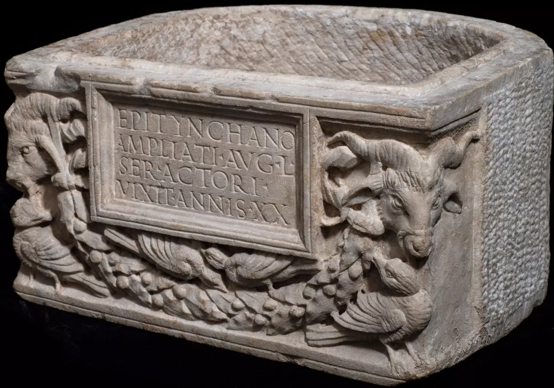
Roman cinerary urn, first century AD

Ede from London is a venerable antiquities dealer. The finest antiquities dealers cater to specialist collectors but also contemporary collectors who like the clean lines, simple palette, and stylized figures of Classical Greek, Roman, and Near Eastern art. The old work gives the new work gravity, and the new work gives the old a dash of pizzazz. I loved Ede's fabulous Roman cinerary urn from the first century AD, the era of Tiberius, which at $38,000 is the best value of the fair. It held the ashes of, as the boldly graphic Latin inscription tells us, "Epitynchanus, the chief accountant of Ampliatos, a freedman from the imperial household, he lived twenty years." We don't know whether our accountant lived to age 20 or balanced Ampliatos's books for 20 years. But it's fitting that his urn — his ashes long ago flew the coop — made it to Park Avenue. New York's becoming more and more like Tiberius's Rome; we still need guys who are handy with an abacus.