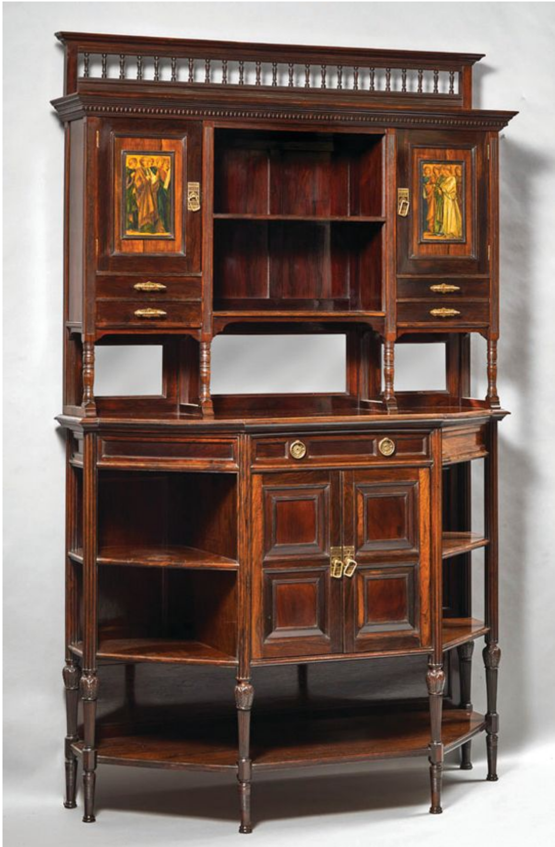
English side cabinet made by Collinson & Lock (around 1875)

This side cabinet was manufactured by the 19th-century London firm Collinson & Lock, which was famous for working with some of the leading artists, architects and designers of